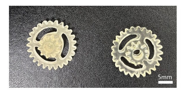
Figure S3. Image of gears that were printed using UTIS1 (left) and UTIS2 (right).